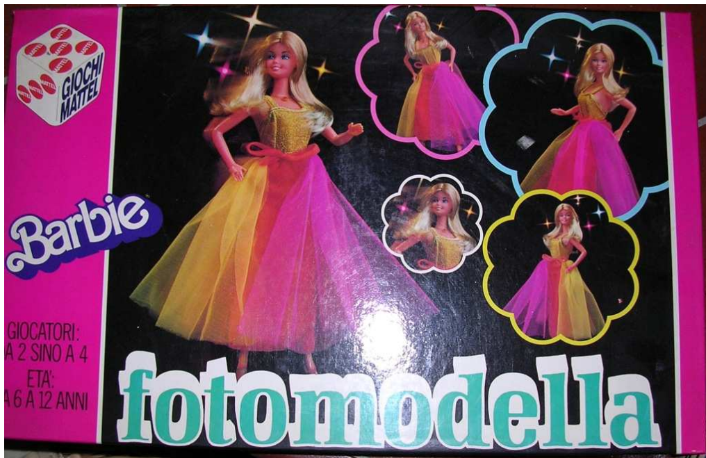
Society game of the Eighties