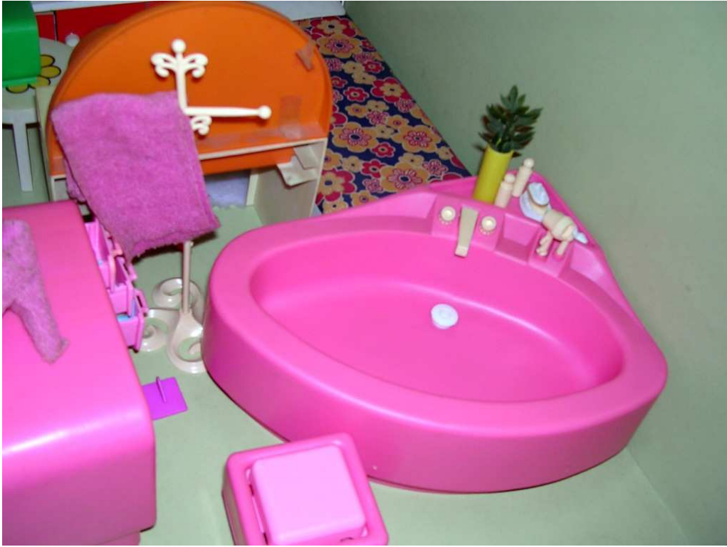
Bathroom of the Seventies