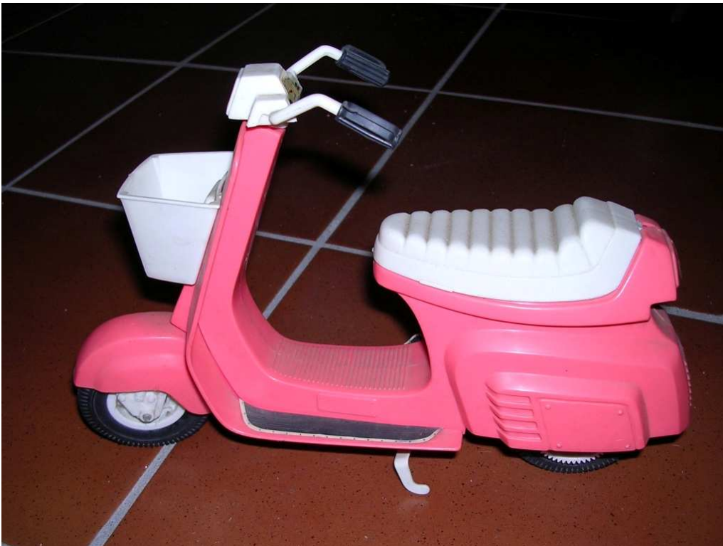
Vespa of the Eighties