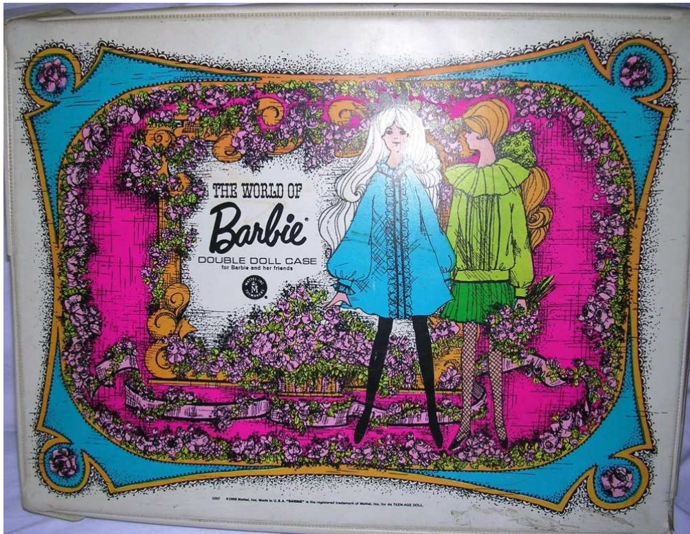
Doll case 1968