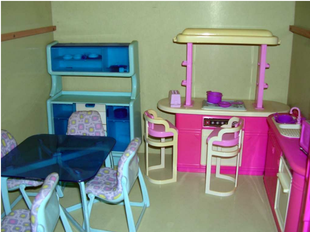
Living room and kitchen of the Seventies