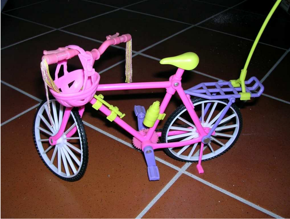
Bike end of the Eighties